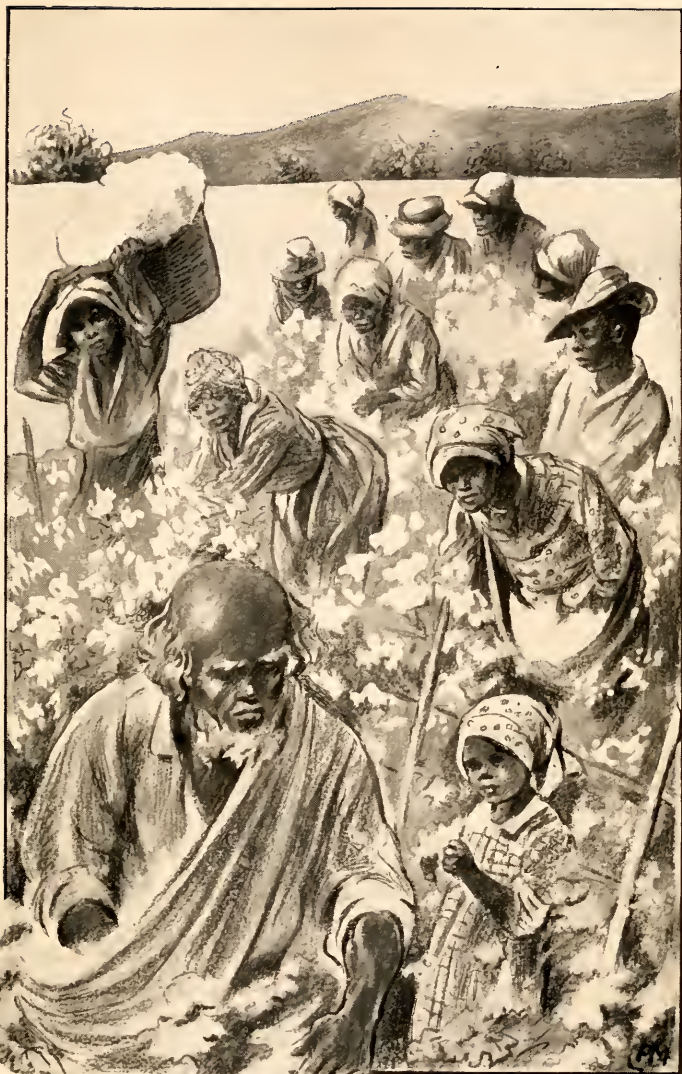
SLAVES AT WORK IN THE COTTON FIELDS